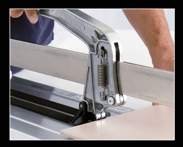
QUICK START SYSTEM

The carriage is provided with springs that makes the handle always ready to cut.